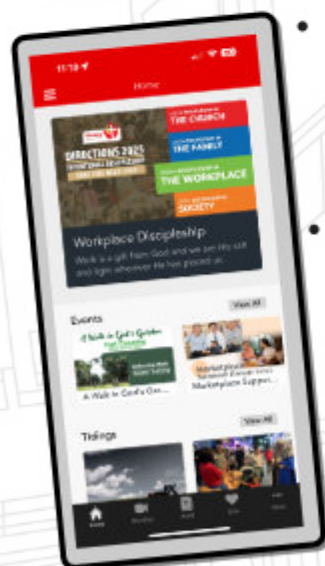
Wesley Mobile App https://wesleymc.org/churchapp