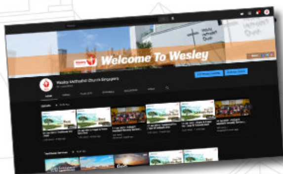
Wesley YouTube Channel Please click the "subscribe" button for the latest updates. https://wesleymc.org/youtube