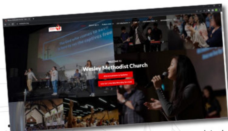
Wesley Website https://wesleymc.org

Dear Wesleyans and Friends, Let's keep in touch and up to date on what's happening in church.