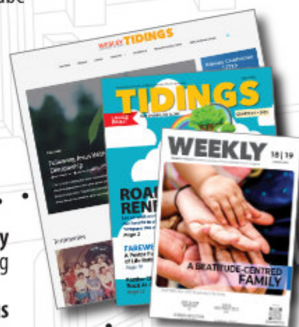
Wesley Tidings https://tidings.wesleymc.org